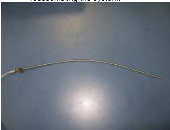
S-B-83.30/74p (June 4, 2009)