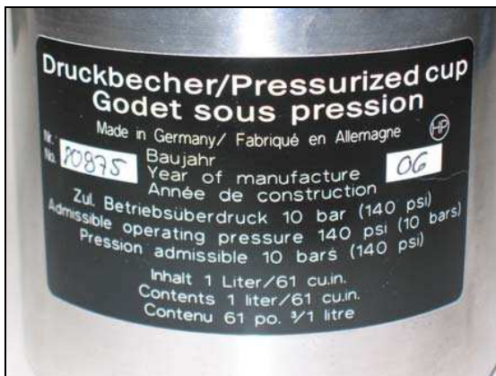
Figure 1b P-B-83.30/74g

⚠ Warning! Do not exceed the manufacturer's recommended maximum air pressure as stated on the label affixed to the pressure cup (Figure 1b). Excessive air pressure could cause the canister to explode and potentially cause personal injury. The recommended pressure to clean the evaporator effectively is 120psi.