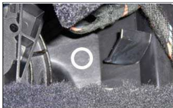
Figure 5 S-B-83.30/74k