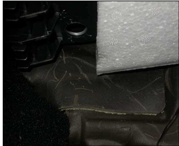
Figure 2 P-B-83.30/74h

Dimension A2 = 10 mm Dimension B2 = 15 mm