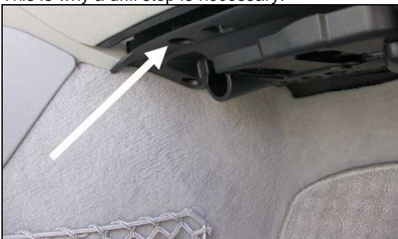
Figure 4 S-B-83.30/74k

⚠ Warning! The drill bit cannot be allowed to penetrate the housing more than 13mm or damage to the evaporator could occur. When the drill bit breaks through the housing it has a tendency to pull inward. This is why a drill stop is necessary.